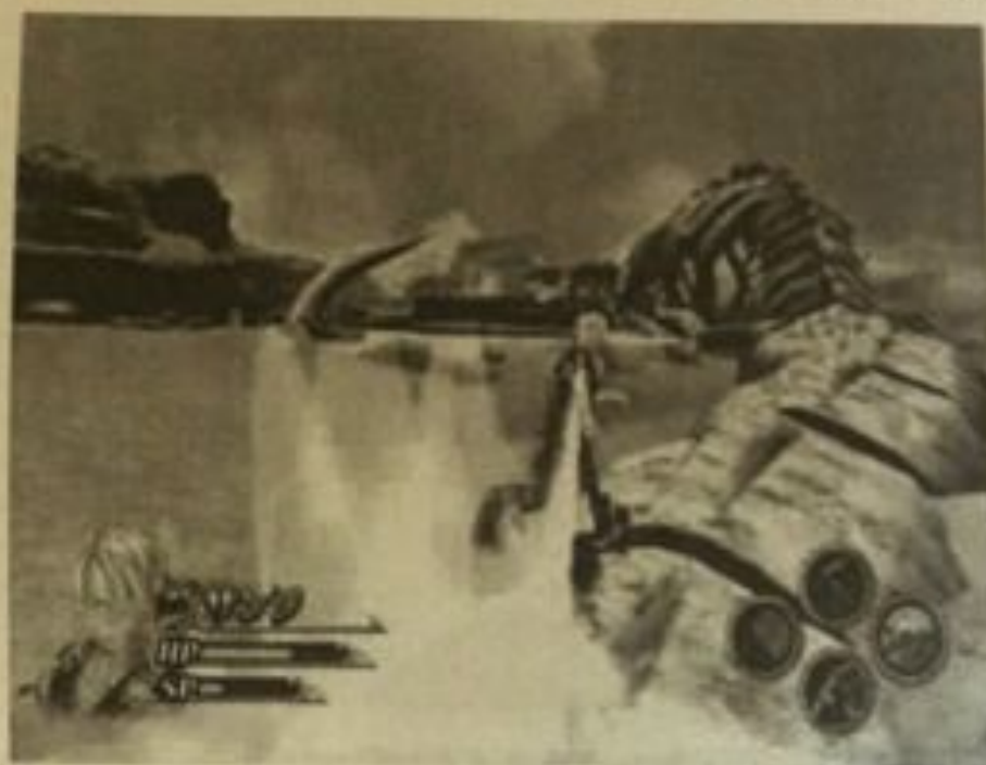
Fig. 8.3 Example of GAP, scaffolding needed in Shooter game via usability testing

bridge; the player was stuck (see Fig. 8.3). They did not know what to do in this learning level and could not continue the game. Had this occurred in a real-world play session life, the player would likely quit the game. Scaffolding was violated, and had it been added, would have assisted the player in continuing the game. Scaffolding would be useful because, if the player still did not understand after being offered a small parcel of assistance, other and more varied parcels would be offered. Usability Testing offered this insight, since the players were stuck without this information.