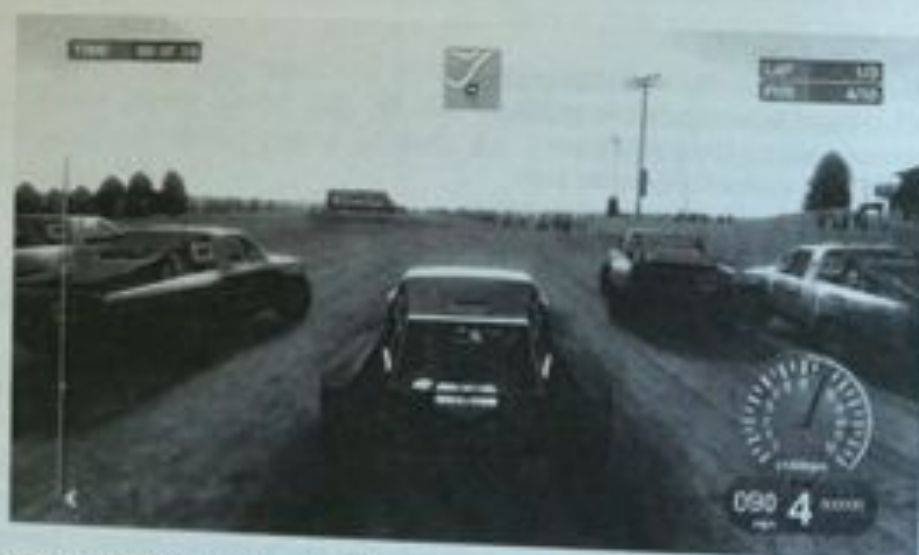
Fig. 8.1 GAP: Self-Efficacy found in Heuristic Evaluation in racing game