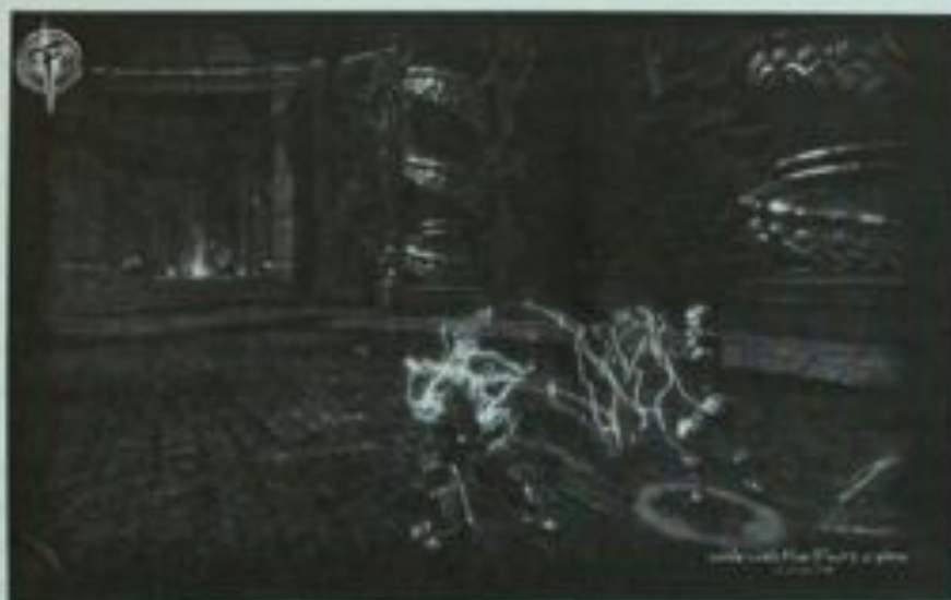
Fig. 8.4 GAP information on demand and in time, system thinking in Shooter game