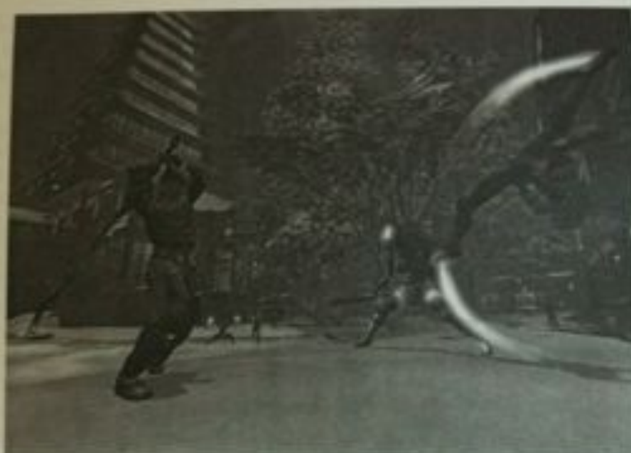
Fig. 8.2 GAP: Gee: Sandbox without consequence, lack of Sandbox in Shooter game

The GAP Gee (Identify, Co-Design, Customization, Manipulation, Information On Demand and in Time, Sandbox) was found in Heuristic Evaluation, but not with the Usability Testing. Observing the users playing the beginning learning levels, it was identified that there was a need for the GAP Gee: Sandbox without consequence. In the Shooter game, players were taught how to use a combination of buttons for attacking their enemies. They were taught three new moves and then were required to use these attacks in game play. Due to the Heuristic Evaluation, players would need to practice any new moves successfully and would otherwise likely lose their characters' lives. Many players would not have enough time to play and master the new skills without consequences, as per the approachability principle Gee: Sandbox without consequence. When the players have the time to practice, they can combine the new skills in an open play format without the risk of losing. When they have learned these skills via the Sandbox, the players would continue to first level with preparation, and thus be able to fairly defend themselves (see Fig. 8.2).